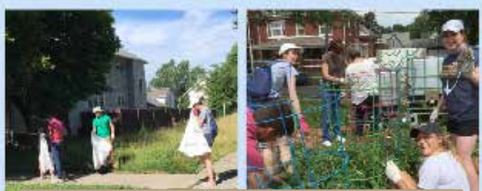
Thank you for all who helped with our neighborhood clean up with Helping Hands of St. Louis!