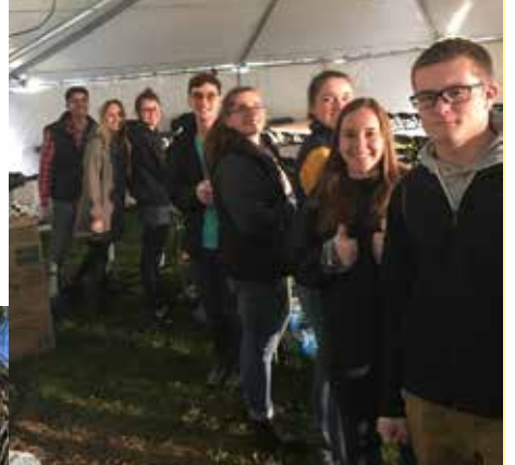
^^ Tent City Service Project