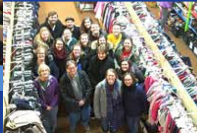
^^ Backyard Mission << Clothing Drive

Thanks for a great year with the Permanent Community