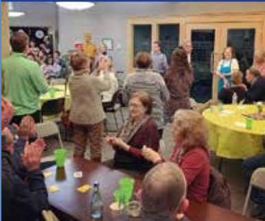
^^ CCUP Mixer

Thanks for a great year with the Permanent Community