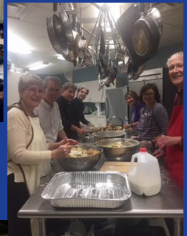
^^ Sunday Night Student Dinners