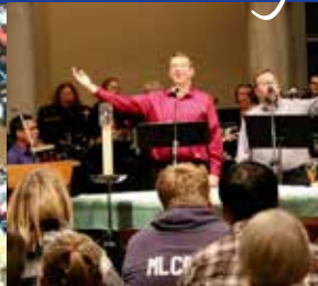
<< Toledo Symphony Concert