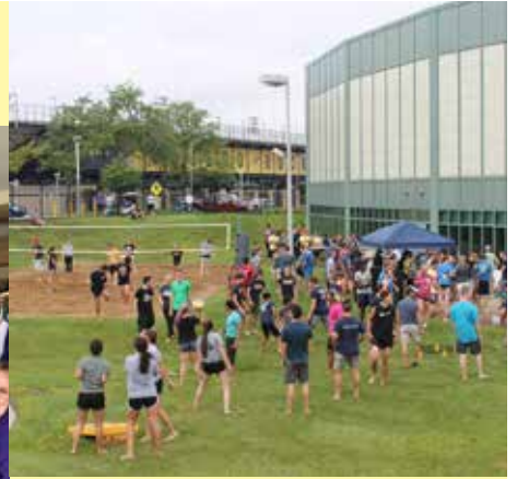
^^ Volleyball Tournament