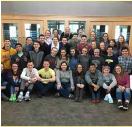
^^ CLP Retreat