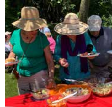
Corpus Christi Sunday