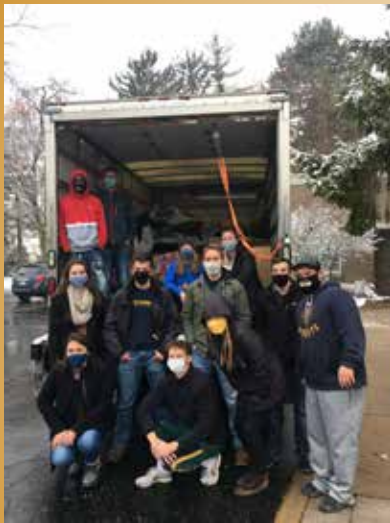
Thanksgiving Clothing Drive

In the midst of these uncertain times, when many have been hit extra hard financially, our parish generously stepped up once again to provide clothing and gifts to those in need!